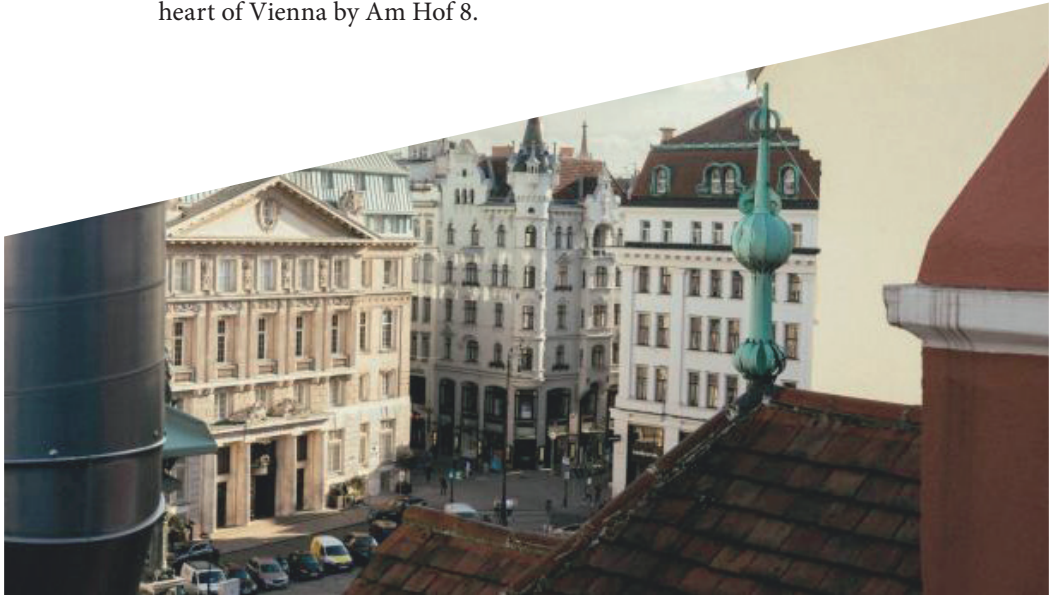
Photo: Old Town Vienna

On sunday the brunch will be hosted in the exclusive spaces in the heart of Vienna by Am Hof 8.