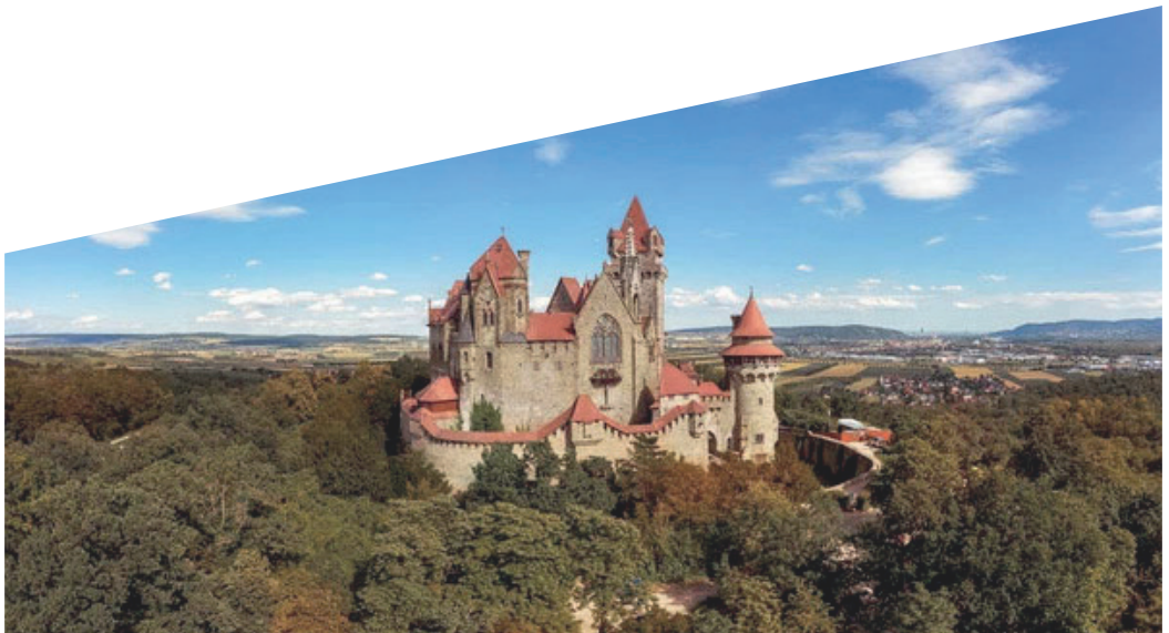
Photo: Castle Kreuzenstein

Kreuzenstein Castle is also famous as a film location. Several notable movies were shot in the castle's picturesque setting, including the 1993 movie The Three Musketeers . Additionally, the castle is home to several cultural events, including concerts, exhibitions, and historical reenactments.